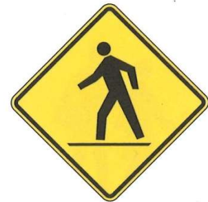
WC-2R 600 mm x 600 mm

The pedestrian symbol on the sign must be walking toward the centre of the road. The right version of the sign is installed on the right side of the road. On one-way streets or divided roads, the left version of the sign may also be installed on the left side or in the median, with the pedestrian symbol walking toward the centre of the road.