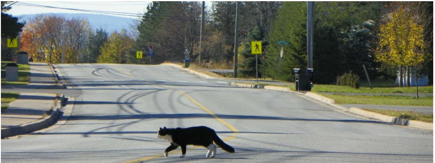
Potential setting, less bright signs, allows the actually crossing signs to stand out.

I have sent an e-mail to TAC regarding this, the returning letter simply referenced the A6.4.2.