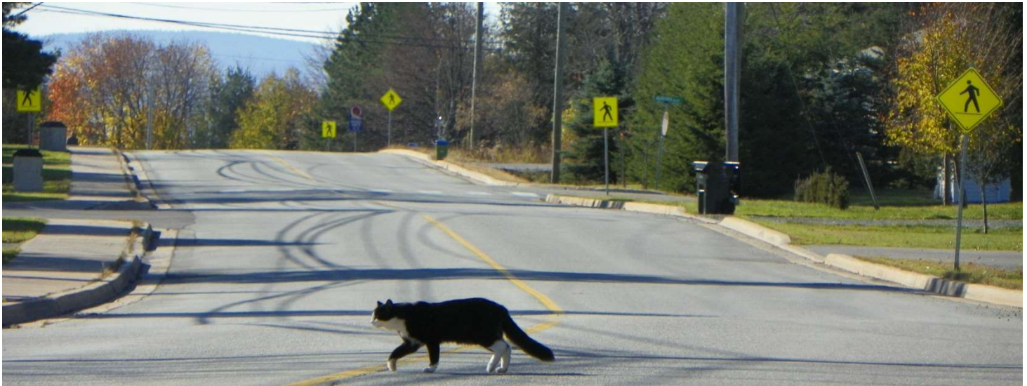
Current sign placement

TAC A6.4.2, could be read as, both the WC-2 could be removed - reducing sign pollution.